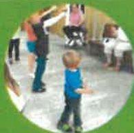
The Holy Spirit Moving in Lake Bronson