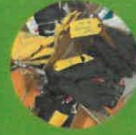
'Warm Hearts Warm Hands' - Good Shepherd Lutheran