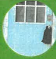
First Lutheran's "Reverse Trick or Treating"