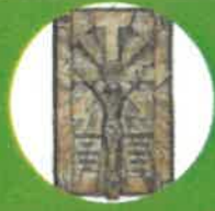
Trinity Lutheran in Pelican Rapids commissions original